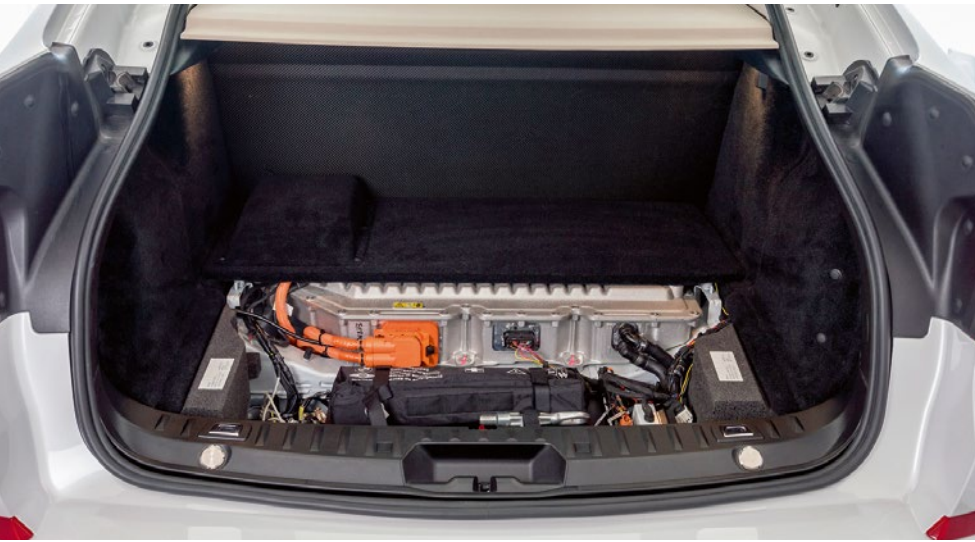
FIGURE 3: The system integration challenge: numerical methods must be further developed

cessfully and quickly put into industry practice for classic combustion engines. Freely available simulation methods developed in research projects have played a major role in this context [2]. Especially small and medium-sized enterprises (SMEs) benefit from the fact that ideas from pre-competitive joint research can swiftly be tested for feasibility.