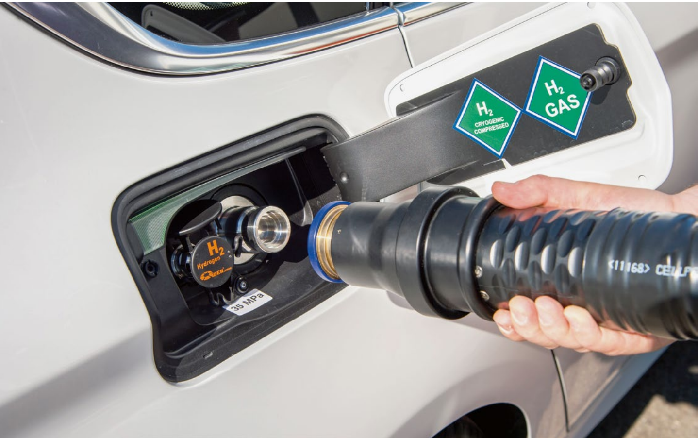
FIGURE 1 Hydrogen as an energy source provides emission-free and practicable long haul mobility

recharge, high energy density and operation independent from outside temperatures, FIGURE 1 . However, the cost of low-temperature fuel cells suitable for vehicle applications is still too high for economically viable, large-scale standard production, one of the reasons being the use of the precious metal platinum at reactive cell membranes. This is why FVV have initiated application-oriented joint research into fuel cells with the objective to significantly lower the cost of future fuel cell generations through innovative solutions, focussing on the following technical approaches: